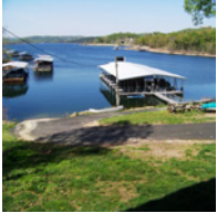
Table Rock Lake sports over 745 miles of scenic shoreline and 43,100 acres of water to play on, which makes Lakeside Resort your perfect vacation destination. From water sports, to fishing, shopping, sightseeing, and the music shows in Branson, there is something for everyone here in the Ozarks.