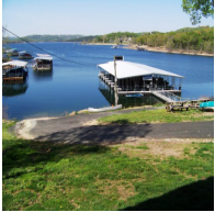
Table Rock Lake sports over 745 miles of scenic shoreline and 43,100 acres of water to play on, which makes Lakeside Resort your perfect vacation destination. From water sports, to fishing, shopping, sightseeing, and the music shows in Branson, there is something for everyone here in the Ozarks.